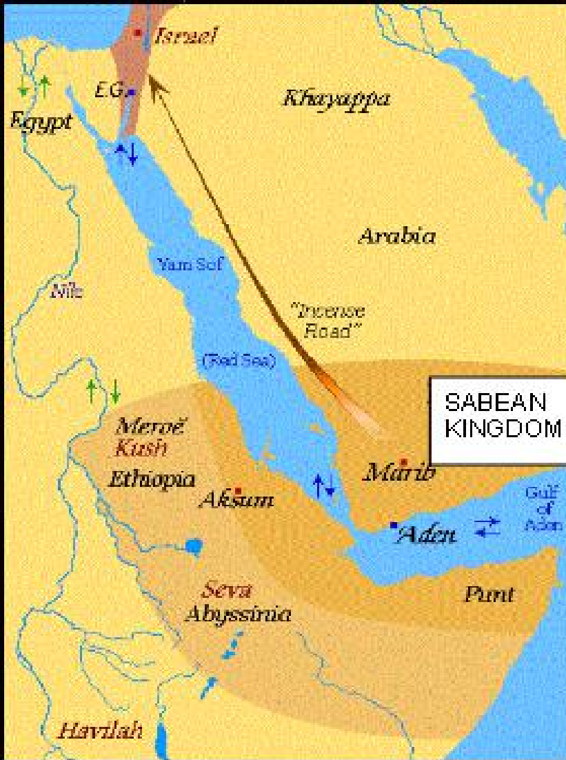
Trade Routes Between Israel and Africa