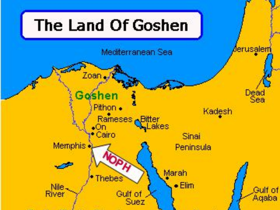
JOSEPH'S PALACE AT AVARIS